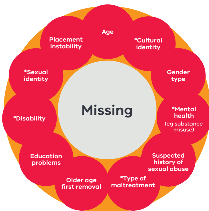
Figure 1: Risk factors for going missing

* This figure contains some examples of possible risk factors that require more evidence to confirm a relationship with going missing.